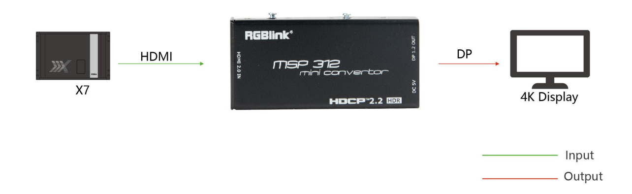
MSP 312 System Connection Diagram